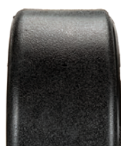
13" Smooth Polyresin Tread