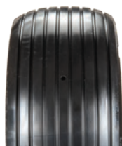
13" Grooved Polyresin Tread