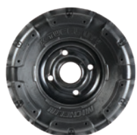
MSPN 68495, 67693, 65492, 64998 & 03488