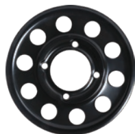
MSPN 21709 & 29242