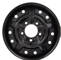
MSPN 49265 & 10545