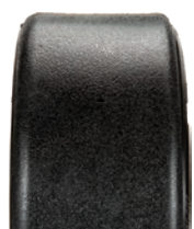
13" Smooth Polyresin Tread