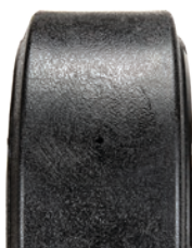
15" Smooth Polyresin Tread